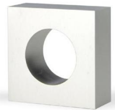
Round (Template B)